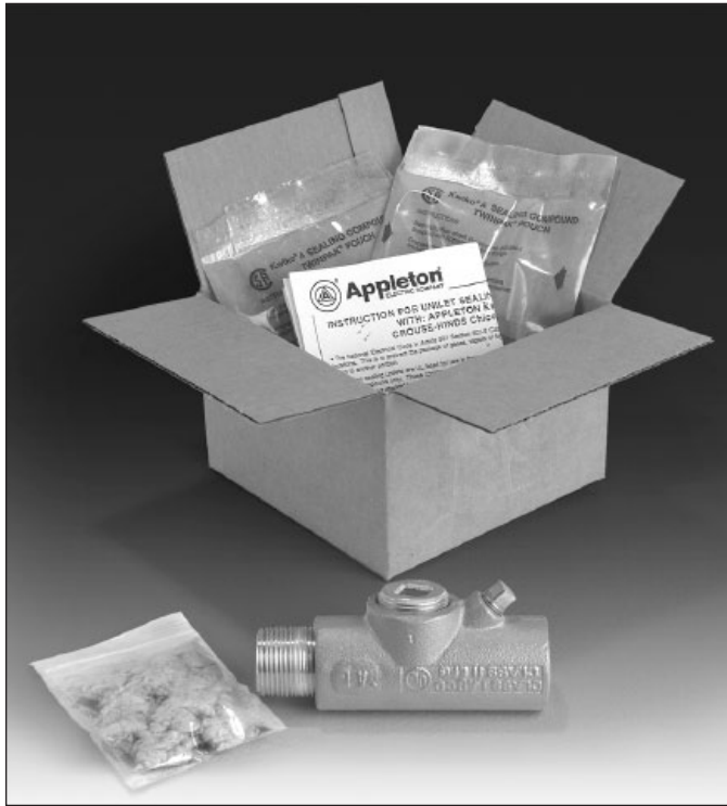
Conduit seal kit includes fitting, fiber, and cement

Orenco's Conduit Seal Kits create a watertight, gastight seal between a conduit and a splice box that prevents the passage of liquids, vapors, or flames.